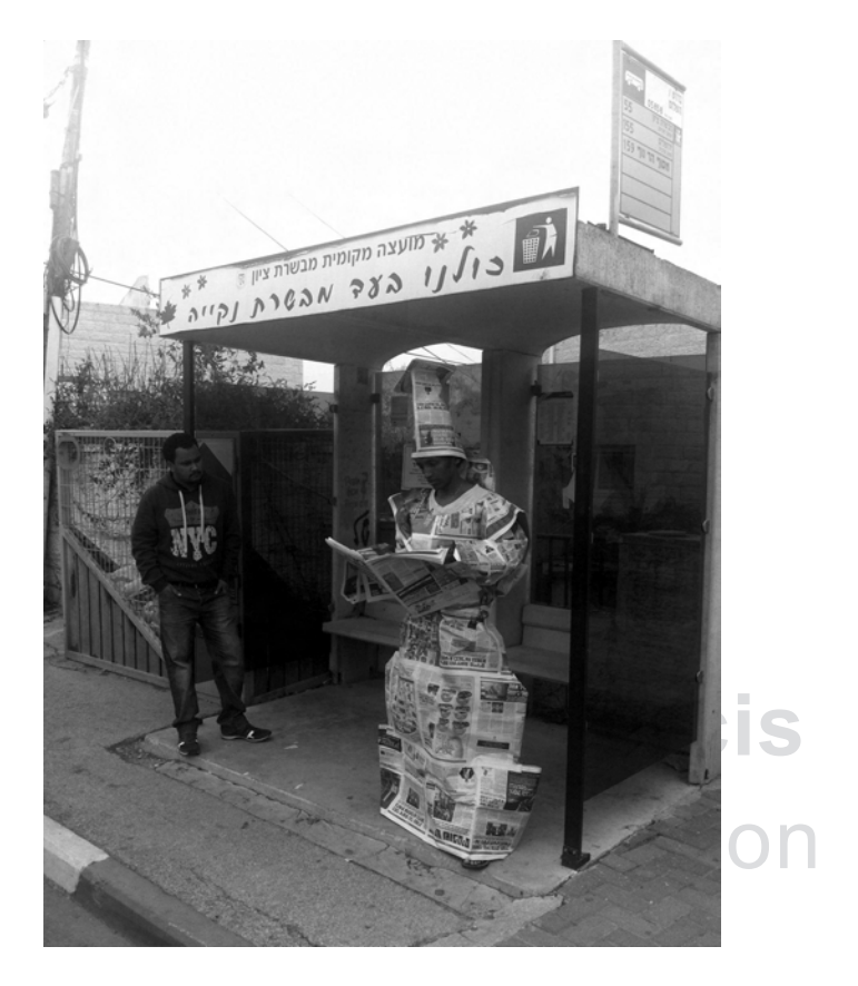
Figure 13.4 Wearing something different: clothes to read the newspaper at the bus stop. Jude Michael.

A more complex example of a Do Something Different is the challenge to do something your significant other always does that you never do. This requires reflection and observation of one's roommate, parent, boyfriend, or pet, and selecting those traits, such as peeing standing up (boyfriend), obsessive compulsive behavior (parent), chewing tobacco (roommate), or riding in a car with your head out the window (dog), that are interesting and replicable. Implementing the task on a day-long basis can be both embarrassing and surprising: One single dad copied his nine-month-old son and wore (and used) an adult diaper through the course of a day. Perhaps the most normal and yet divergent different of this type was a guy